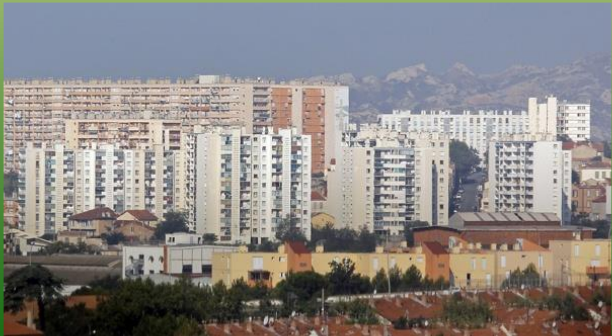
Marseille Quartiers Nord