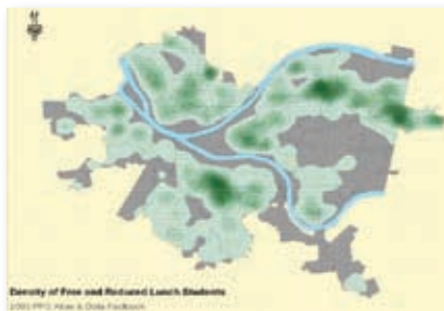
Sample analytic map showing where impoverished students reside.

transcription lab and a 10-station coding lab which utilizes ATLAS.ti, a PC-based workbench that supports project management, enables multiple coders to collaborate on a single project, and generates output that facilitates the analysis process. On the QDAP web site, we support the Coding Analysis Toolkit (CAT), a web-based suite of tools which facilitates efficient and effective post-coding analysis of qualitative data. In addition, we offer ATLAS.ti and CAT training seminars and one-on-one training sessions for faculty, staff, and students.