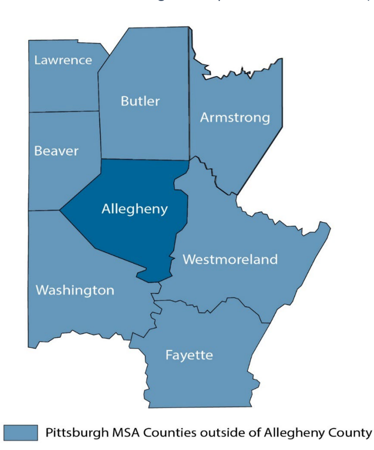
Figure 2 Counties of the Pittsburgh Metropolitan Statistical Area (MSA)

Note the Pittsburgh Metropolitan Areas (MSA) is currently defined as eight counties: Allegheny, Armstrong, Beaver, Butler, Fayette, Lawrence, Washington, and Westmoreland counties in southwestern Pennsylvania. The Pittsburgh MSA was recently redefined in 2023 to include Lawrence County. Previously the Pittsburgh MSA was defined as seven counties. The Pittsburgh MSA profile here reflects the current eight-county definition of the MSA in both time periods. Figure 2 shows the current definition of the Pittsburgh MSA.